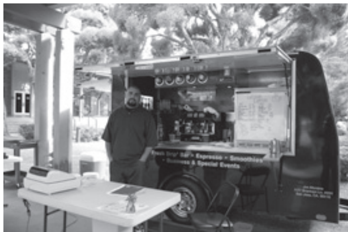
Curbside Espresso Bar.

TRIO is committed to increasing graduation and transfer rates by creating a “sense of place” for those students who sometimes feel isolated and disconnected during their college experience. If you are interested in more information please visit the TRIO Program in the Library (L1109) or call 408-846-4981.