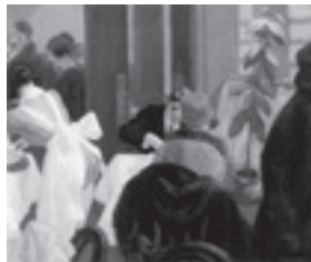
Edward Hooper - New York Restaurant c. 1922

Learn about major artistic and cultural movements, read plays and texts from a variety of periods and analyze films of the historic texts in this exciting face-to-face class.