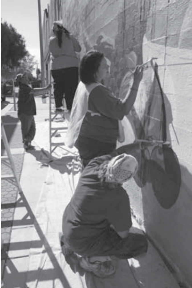
Art 14 Mural Painting class