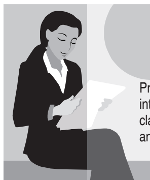
also listed as CMUN 2