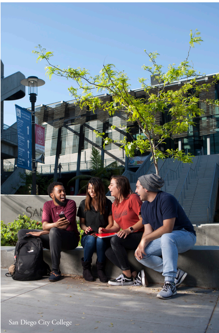
San Diego City College