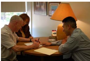
Student service outcome work

"Many service programs that had never done this before often need extra assistance," he said.